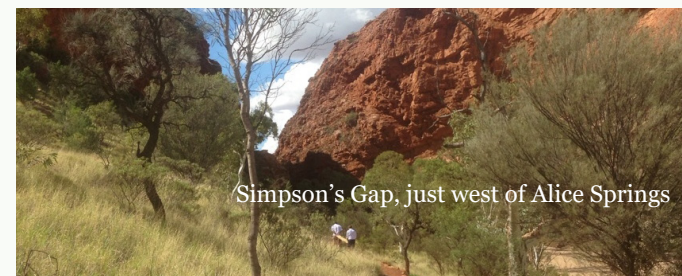
Simpson's Gap, just west of Alice Springs

6:30 - 8:00pm Lamentation in Landscape & candlelight procession at Anzac Hill followed by shared meal.